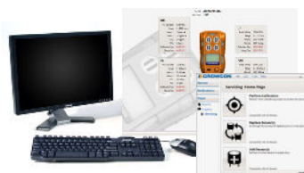
NEW Portables Pro 2.0 Software For easy configuration and servicing