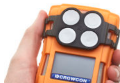
External filter plate Clip-on filter for dusty environments