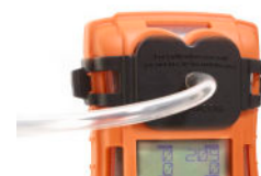
Bump/calibration plate To apply test gas to T4