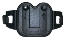
Aspirator plate Sample atmosphere prior to entry