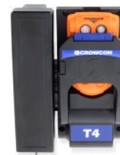
Vehicle charger Effective charging and storage whilst travelling