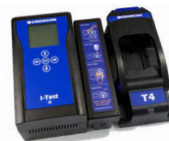
I-Test Easy automated bump testing and calibration solution