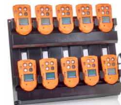
10 way charger For charging and storing your T4 fleet