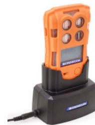
Cradle charger Docking station for easy charging