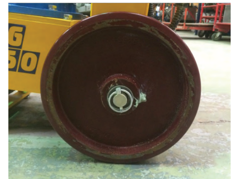
REAR WHEELS (WITH RETAINING PIN)