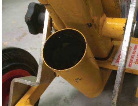
DUST EXTRACTION OUTLET