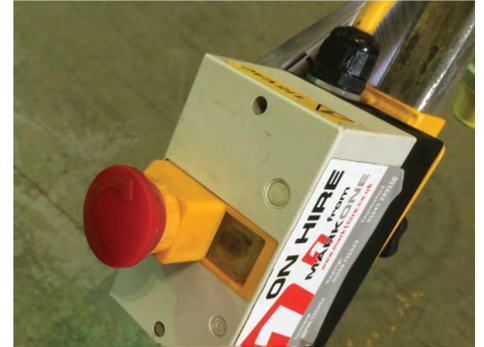
WATER TAP ON SIDE