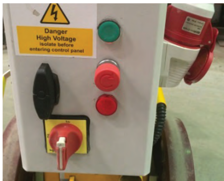
SWITCHES, PLUGS & BUTTONS

TO RESERVE ANY OF OUR TOOLS OR MACHINES CALL US ON 01245 399150