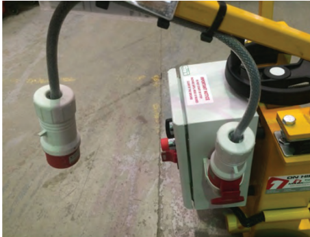
THE FLY LEAD

PLEASE CHECK THE FOLLOWING UPON DELIVERY