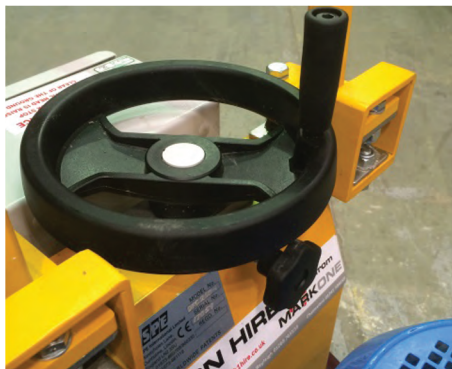
HEIGHT ADJUSTMENT WHEEL