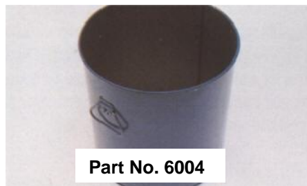
Part No. 6004