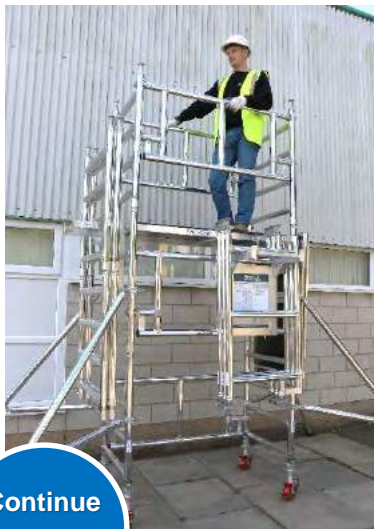
16. Remove toeboard.