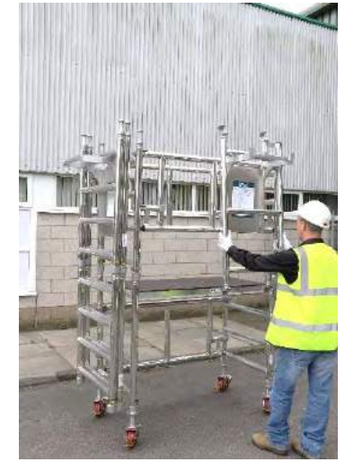
15. Stow 3 guardrail frames on the front assembly bracket.