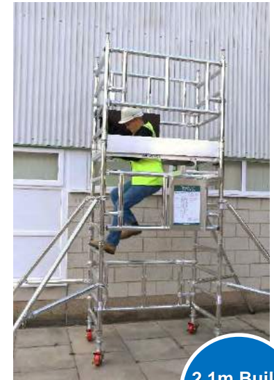
15. Access the platform using the trapdoor as shown and begin work.