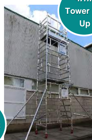
4.1m Tower Set Up