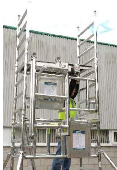
27. Fit the platform, 1 rung above the side frame location as shown.