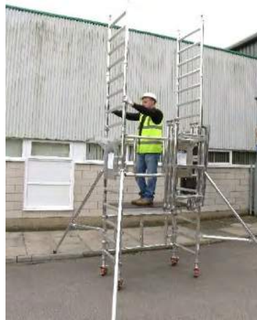
22. Repeat this process for the opposing side, ensuring that all interlock clips are engaged.