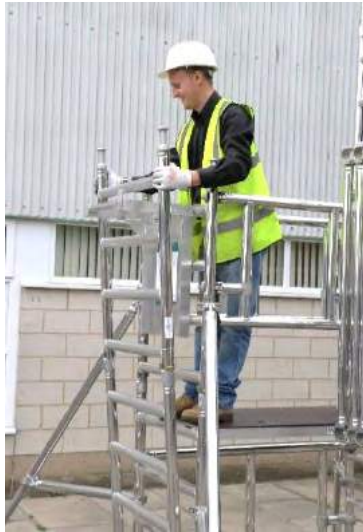
21. Retrieve a set of frames from the side assembly bracket and fit.