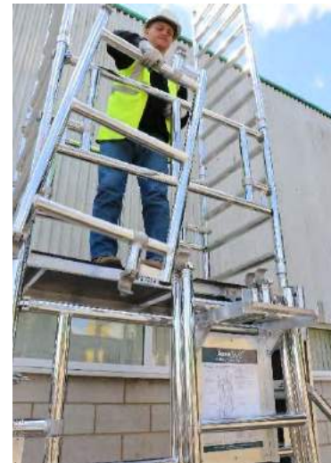
19. Retrieve a side guardrail frame from the front assembly bracket and pass upwards as shown.