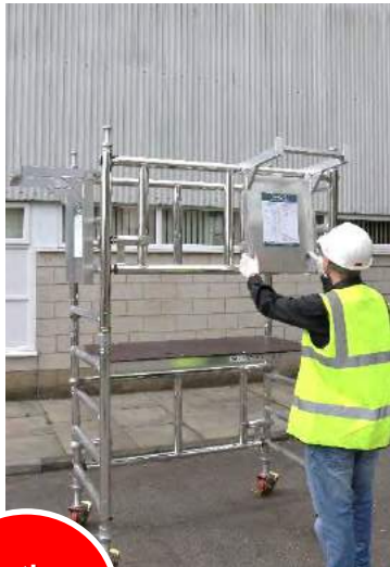
11. Remove toeboard and fit 2 assembly brackets in the position shown (side and front)