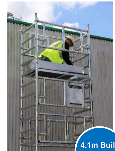
30. Fit toeboard.