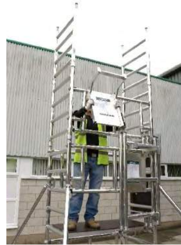
24. Relocate the side "empty" assembly bracket on the front of the tower (top rung of the tallest guardrail frame as shown)