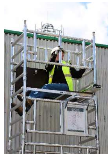
29. Fit 2 guardrail frames, with the top hook (facing outwards) set above the top rung of the frame.