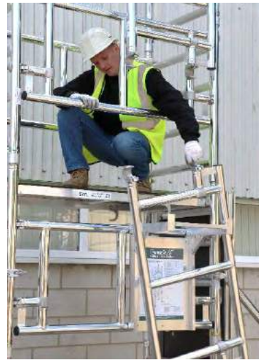
23. Retrieve 2 stowed side guardrail frames from the lower assembly bracket (front) pass them up to be relocated on the higher assembly bracket.