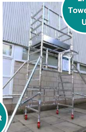
2.1m Tower Set Up