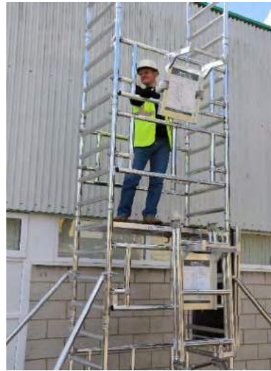
22. Place the removed bracket on the top rung of the tallest guardrail frame as shown.