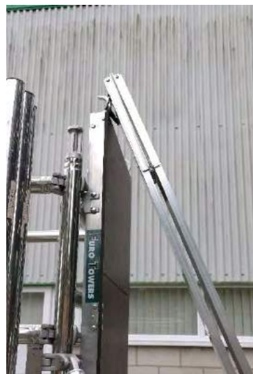
17. The toeboard can be located over the platform hook using the dedicated hanging strap.