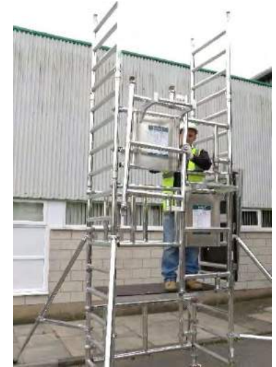
25. Retrieve a side guardrail frame from the front assembly bracket and locate it as shown.