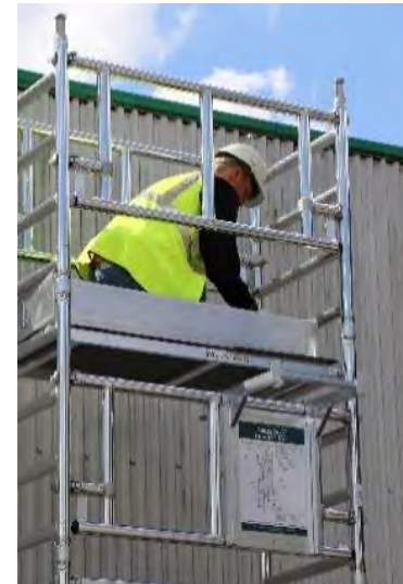
14. Fit toeboard by unfolding the set above the platform (please use labelling as a reference to ensure that the toeboard is the correct way up).