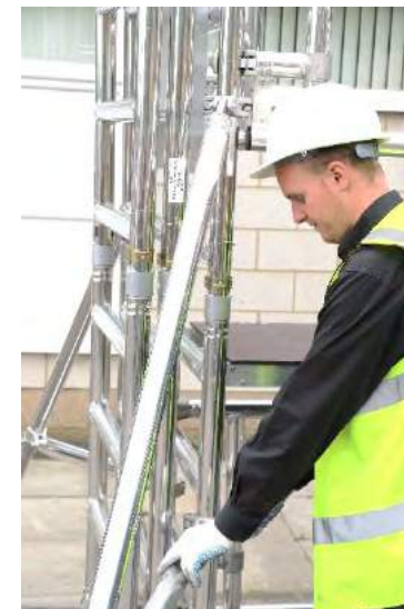
19. Fit 4 stabilizers, one on each upright of the tower.