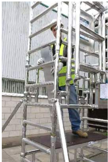
26. Temporarily locate the toeboard assembly on the platform to allow access to the additional platform that is stowed.