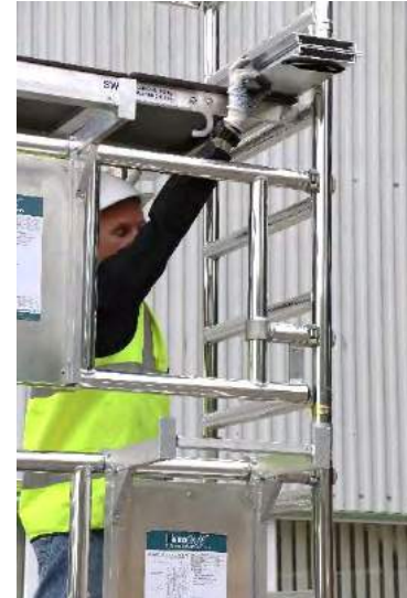
29. Relocate the toeboard assembly from the lower platform to the higher level, ensuring that it is positioned on the plain section of the platform as shown.