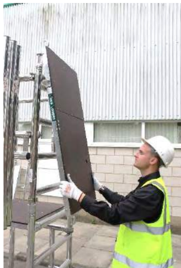
16. The platform can be located on the opposing side of the tower from the frames.