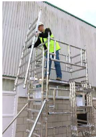
17. Retrieve a set of frames from the side assembly bracket and fit.