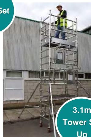
3.1m Tower Set Up