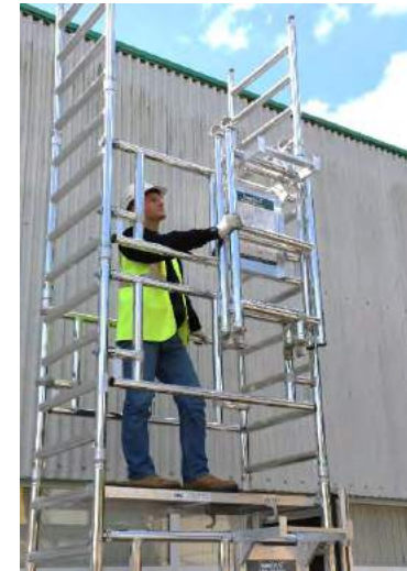
24. The frames are relocated as shown.