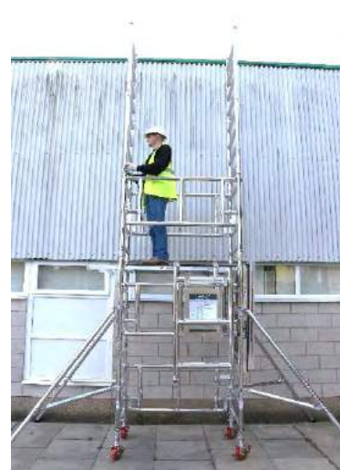
18. Repeat this process for the opposing side, ensuring that all interlock clips are engaged.