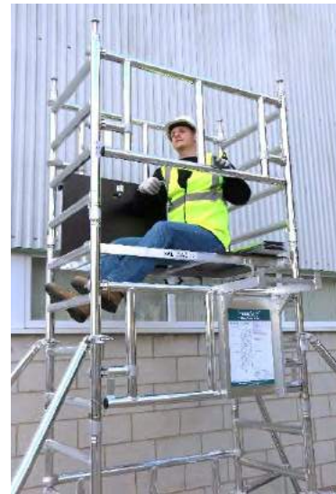
13. Fit 2 guardrail frames, with the top hook (facing outwards) set above the top rung of the frame.