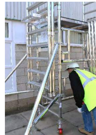
20. Access the platform by passing under the side frame and via the trapdoor platform.