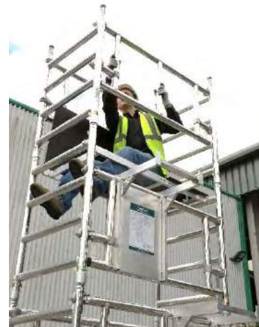
28. Fit 2 guardrail frames, with the top hook (facing outwards) set above the top rung of the frame.