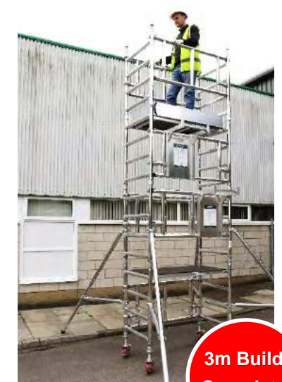
30. Access the platform using the trapdoor and unfold the toeboard.