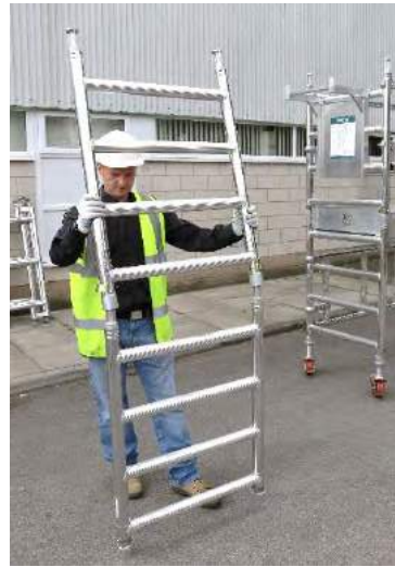
12. Assemble the frames in pairs as shown.