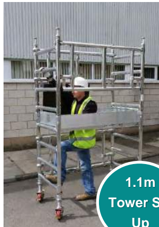
1.1m Tower Set Up