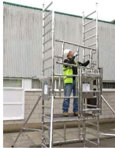
23. Retrieve a side guardrail frame from the front assembly bracket and locate it as shown.