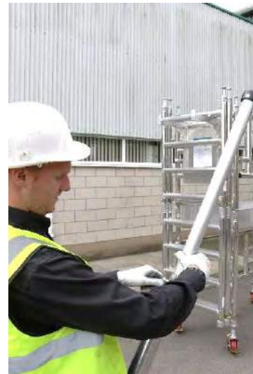
18. Before fitting stabilizers, release the pin to enable extension.