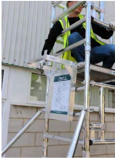
21. Relocate the “empty” assembly bracket from the side of the tower.