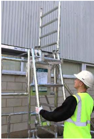
11. Stow the guardrail frames on the front assembly bracket.