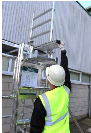
12. Relocate the toeboard assembly from the lower platform to the higher level, ensuring that it is positioned on the plain section of the platform as shown.