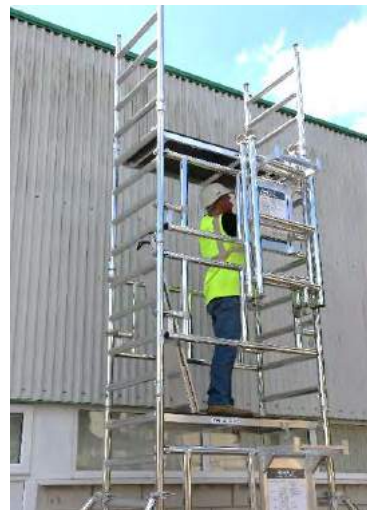
27. Fit the platform, 1 rung above the side frame location as shown.