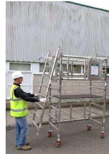
14. Stow 4 frames (2 pairs) on the side assembly bracket.