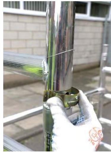
13. Engage interlock clips.