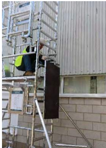
26. Remove the remaining platform from the lower section of the tower and pass up through the side frame.