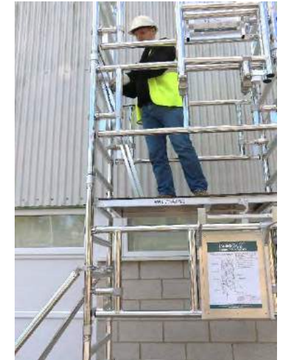
25. Temporarily locate the toeboard assembly on the platform to allow access to the additional platform that is stowed.