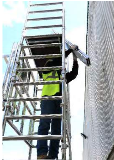
28. Relocate the toeboard assembly from the lower platform to the higher level, ensuring that it is positioned on the plain section of the platform as shown.