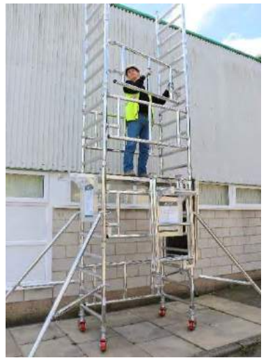
20. Fit 1 side guardrail the 3 rd rung above the existing as shown.