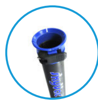
Clamped Carbon Fibre Poles