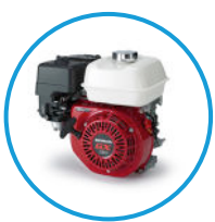
Onboard Honda Motor