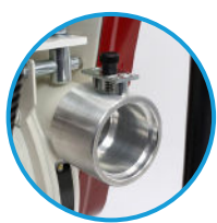
Blow Function Feature